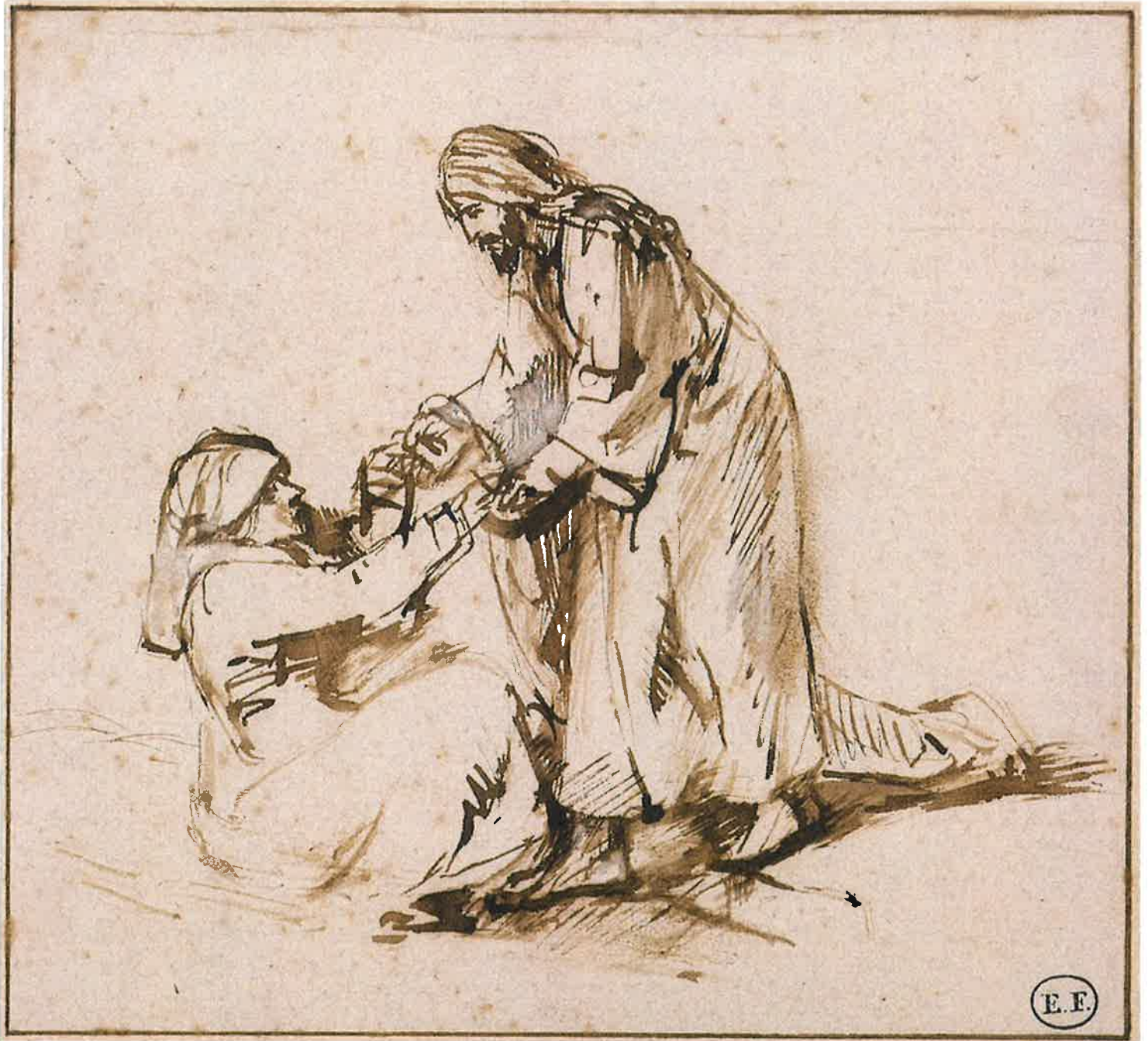
The Healing of the Mother-in-Law of Saint Peter" by Rembrandt